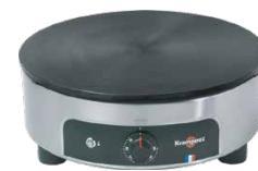
CEBIR4 CS / AS