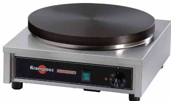
Surfaced cast iron griddles