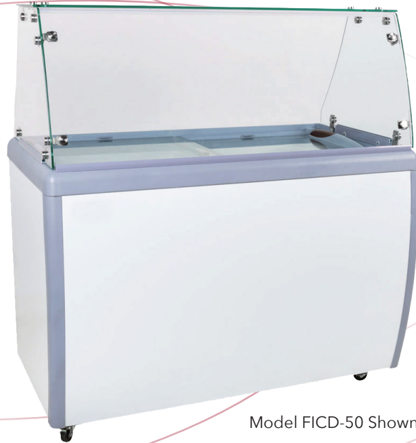
Model FICD-50 Shown