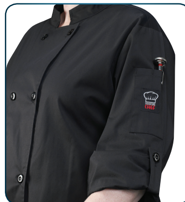
Thermometer pocket on sleeve & roll-tab sleeves