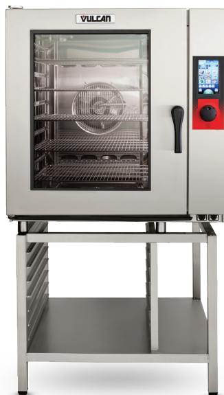
TCM102 shown on optional stand

Stainless steel racks with cutout design provides ease of access to pans, promoting kitchen safety.