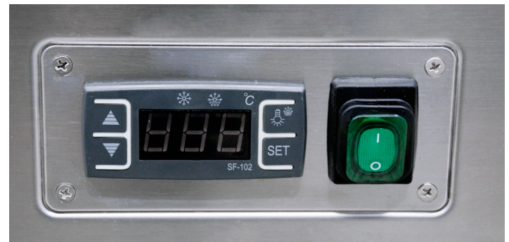
Digital temperature controller & display