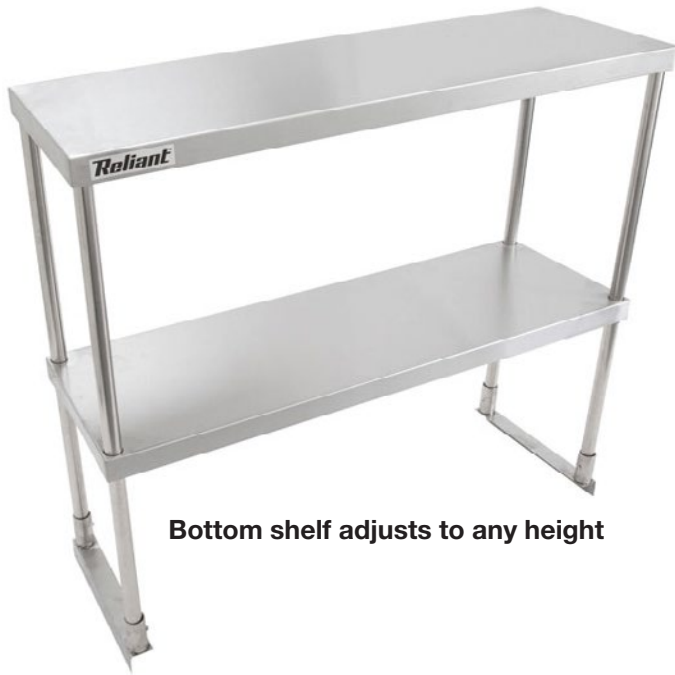
Bottom shelf adjusts to any height