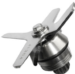
New and Improved Cutting Blade